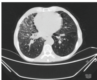
Figure 1. Chest computed tomography (CT); diffuse hyper-aeration of both lungs with interstitial infiltrations in the right middle, right upper, and right lower lobes as well as inter-lobar fissural nodular lesions.

Urgent right femoral access was placed and therapeutic plasmapheresis was initiated. Six plasmapheresis sessions were administered. His platelet levels decreased at first but increased subsequently (Table 1). Rituximab was prescribed on day eight of hospitalization. Nine days after admission, the patient developed respiratory distress and